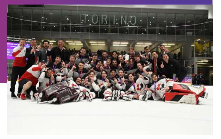
ICE HOCKEY MEN'S Teams: SLOVAKIA(**); CANADA(*); UKRAINE(***)

SHORT TRACK SPEED SKATING MIXED RELAY Teams from left side to right: CHN (**), KOR(*), KAZ (***)